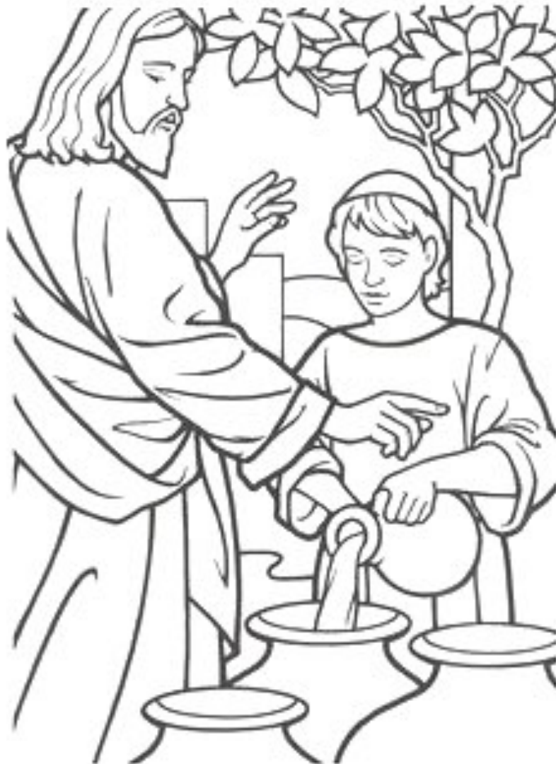
JESUS TURNS WATER INTO WINE

John 2:11 "And his disciples believed in him"